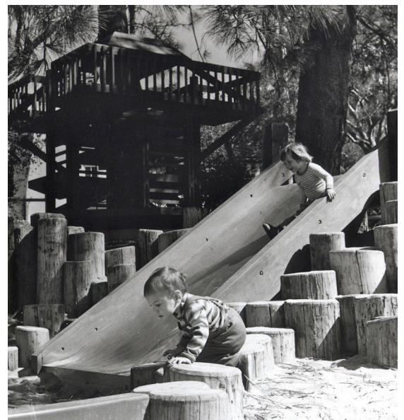
South Laguna Village Green with its tree house, completed as result of SLCA action, 1977.