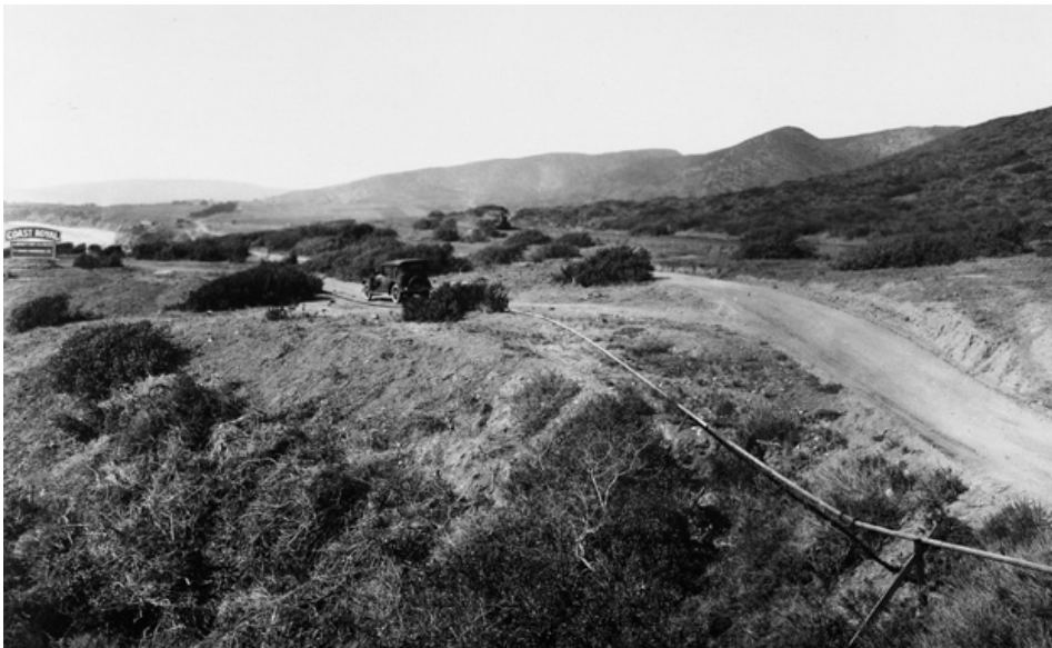
Coast Royal, its streets and waterlines in the mid 1920s, from near West St.

South Laguna has a long history of community activism. When the first lots were created in the 1920s, new residents found their homesites served with an unreliable water system and dirt roads.